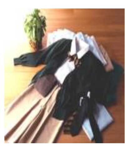
Figure 2: Petrochemical products and high performance materials whose CFP are disclosed (e.g. PX production unit, image of products made from paraxylene)

In calculating this CFP, ENEOS worked to make the numbers more reliable by referring to various guidelines*1 based on a review by WasteBox, an expert in calculating GHG emissions, solidifying the CFP calculation method for petroleum products, and developing a CFP calculation and management system together with NTT DATA.*2 Note that this is the first CFP calculation in the domestic petroleum industry using actual data acquired from refineries.